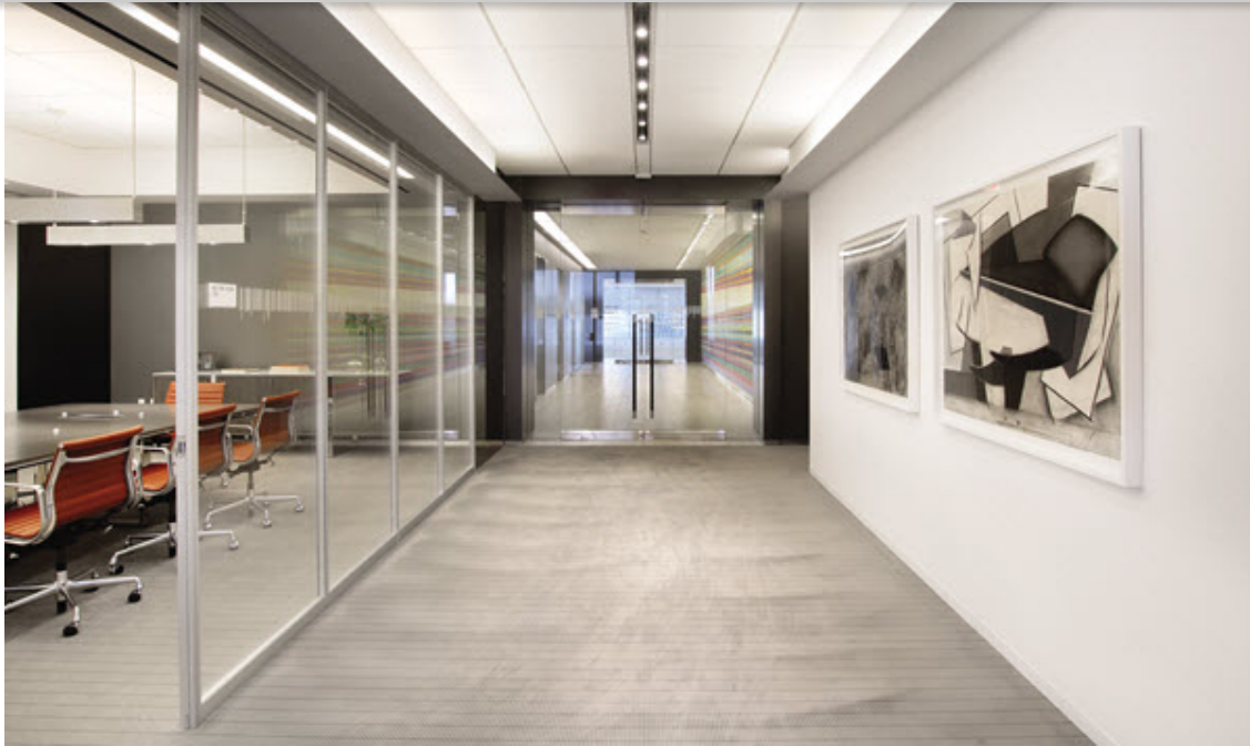
New elliptipar ® cove inside.